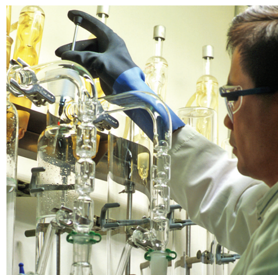
Environmental Compliance samples are tested to assess the effects of business operations on our water

Central Contra Costa Sanitary District (Central San) is a special district (not a county agency) with a five-member elected Board of Directors and about 300 employees. Our mission is to protect public health and the environment through safe and effective wastewater collection, treatment and disposal. Our Environmental Compliance staff consists of highly trained inspectors. Central San is committed to helping businesses in our service area comply with federal, state and local requirements for wastewater and stormwater discharge.