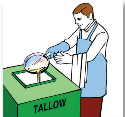
Dispose of cooking oil in tallow bins.