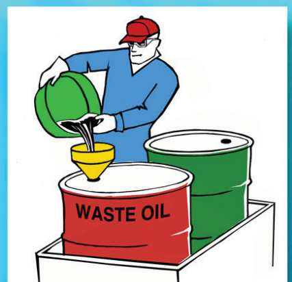
Keep wastes in secondary containment (containers inside containment)