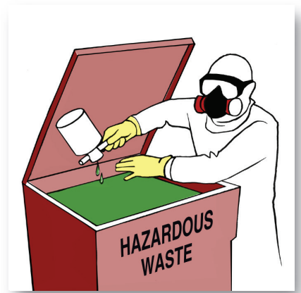
Minimize spillage when transferring wastes to containers.