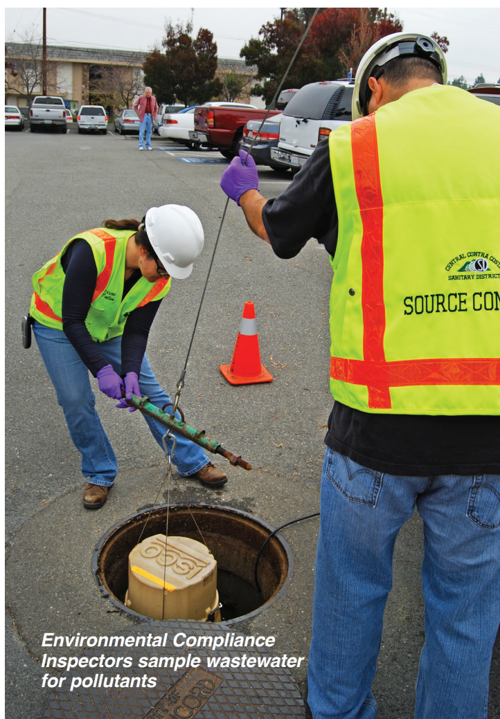
Environmental Compliance Inspectors sample wastewater for pollutants

Stormwater runoff is another major source of water pollution. Rain can wash outdoor spills and undesirable materials into storm drains, which flow directly (untreated) into our creeks and the Bay. The Federal Clean Water Act prohibits anything but rain down the storm drain.