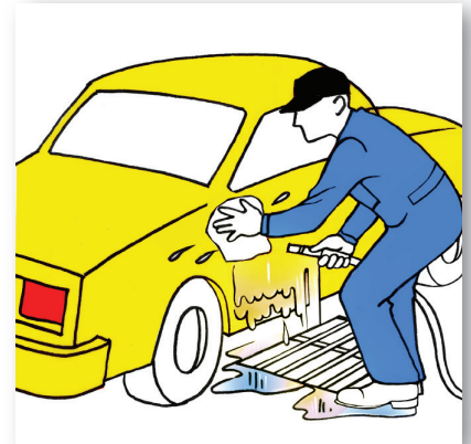
Wash vehicles over an oil/water separator, NOT to a stormdrain.