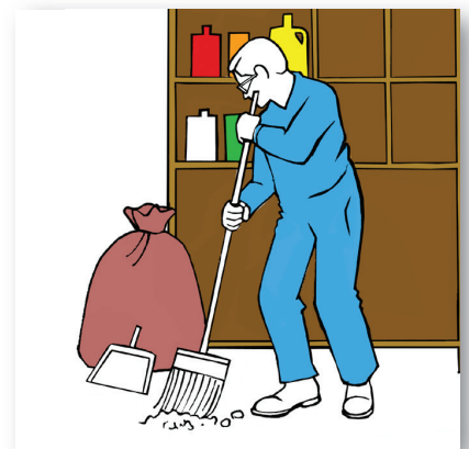
Clean up spills right away.