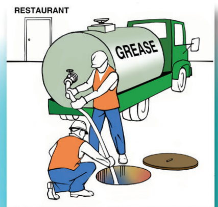
Maintain grease interceptors properly, e.g., schedule periodic pump out.